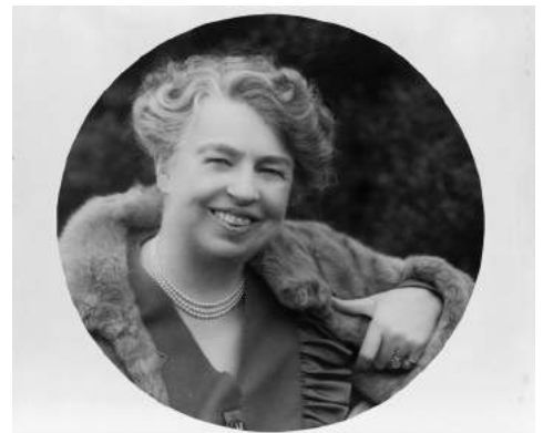
Susan B. Anthony, full-length portrait, seated, facing left. Circa: between 1880 and 1906. www.loc.gov/pictures/item/97500105/ Drawing of Elizabeth Cady Stanton, art located at the Frederick Douglass home in Washington, D.C. www.loc.gov/pictures/item/2011634954/ Eleanor Roosevelt, head-and-shoulders photo portrait. Circa: 1945. www.loc.gov/pictures/item/93503451