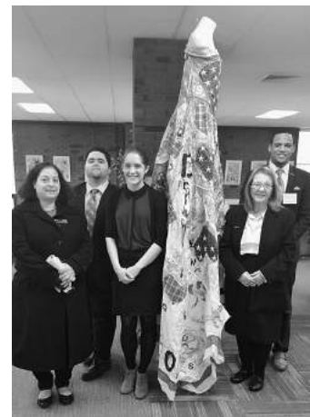
More than 1,000 Staten Island high school students arrive on the campus for workshops sponsored by the Staten Island Chapter and other Sisterhood organizations.